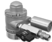
M57 Air Motor